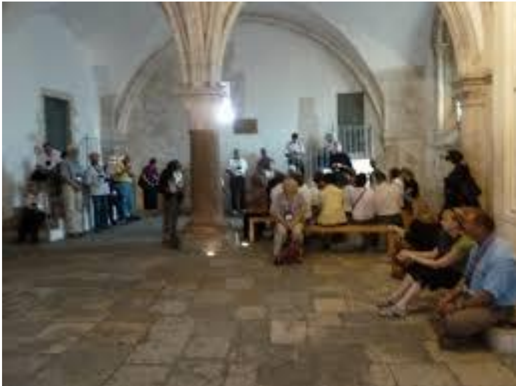
Awaiting Pentecost in the Upper Room