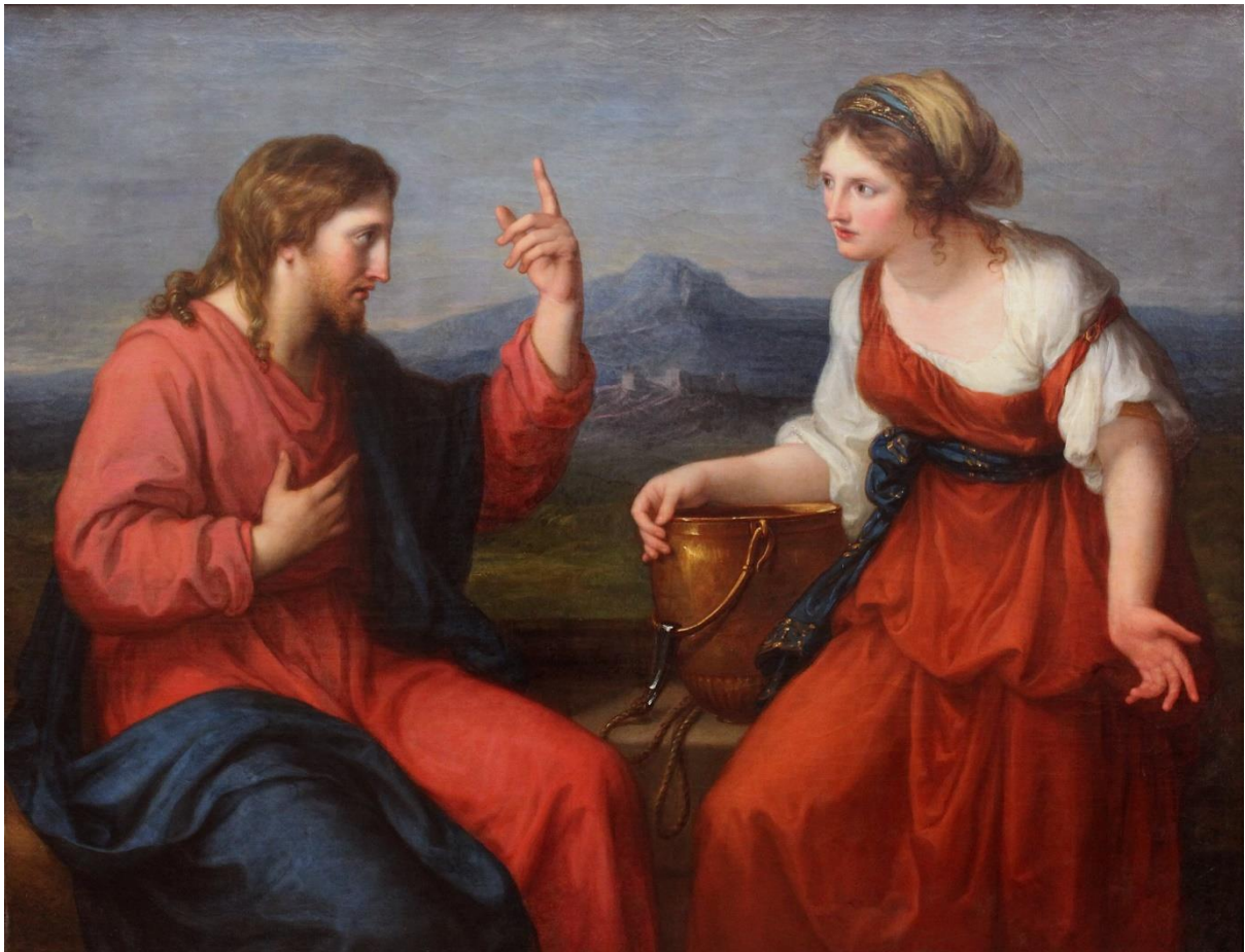
The Samaritan Woman