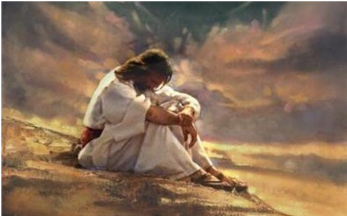
The Temptations of Christ